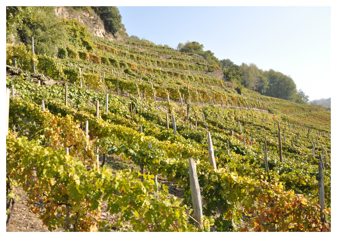
Figure 2: Terracing in Valtellina (Central Alps). Figura 2: Terrazas en Valtellina (Alpes centrales).