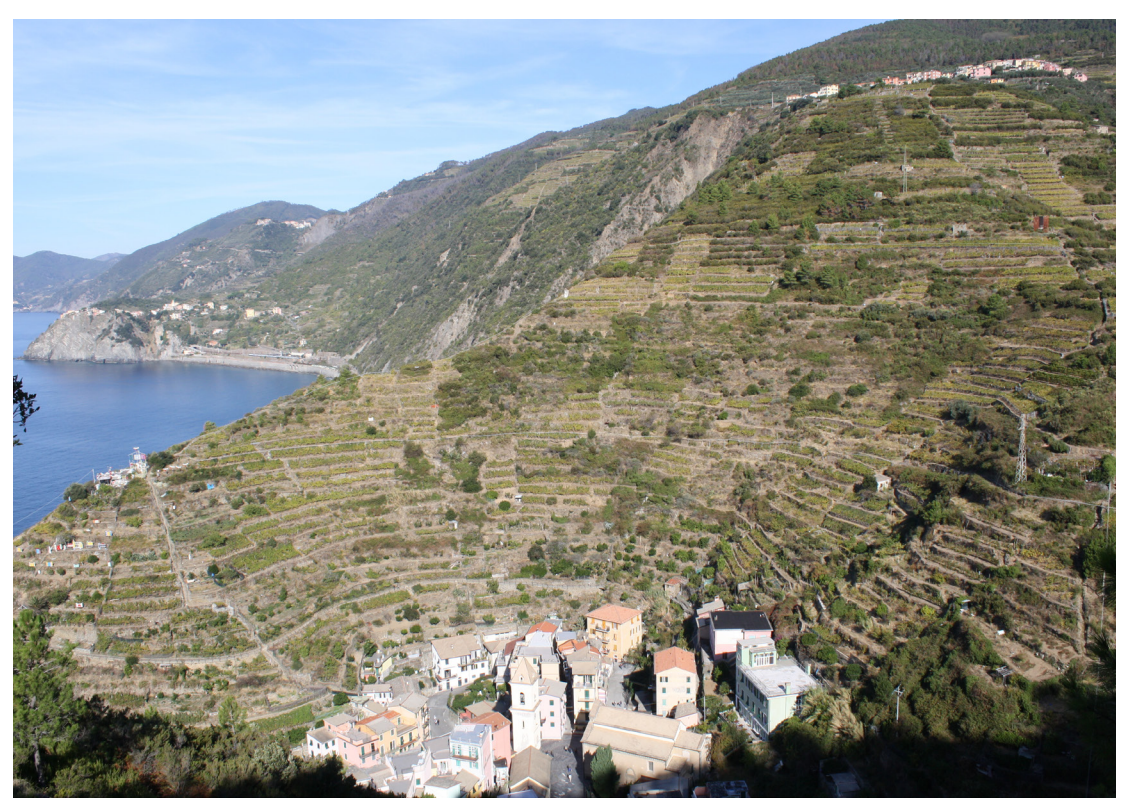
Figure 3: Terracing of Cinque Terre (Riomaggiore, Liguria). Figura 3: Terrazas en las Cinque Terre (Riomaggiore, Liguria).