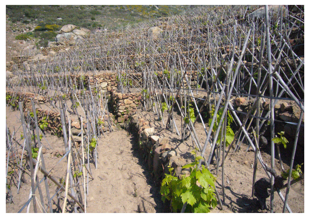
Figure 5: Terraces on Giglio Island (Tuscany). Figura 5: Terrazas en la isla de Giglio (Toscana).