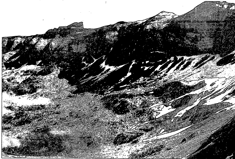
Figure 3. Rockfall deposits and glacial deposits below the headwall, Cirque de Troumouse. The extension fault is picked out by the major gully system of the Cle de Cure.

The Cirque de Troumouse lies within the axial zone of the Pyrenees, a belt of intensely folded and faulted Palaeozoic rocks (Parish, 1984). Pre-Mesozoic basement rocks outcrop near the lip of the cirque at 2100 m. These are comprised of granitic gneisses, marbles and schists. The basement rocks are overlain by Upper Cretaceous white limestones. A series of springs demarcate the extent of the limestone across the floor of the cirque near the